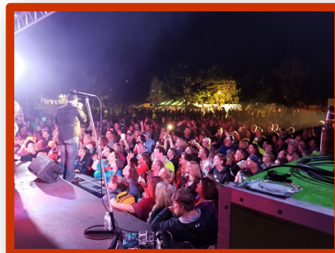
Riverside Park—8220 Elm Street