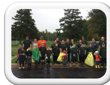
Thank you for keeping the banks of the Crow River looking beautiful!